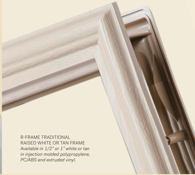
R-FRAME TRADITIONAL RAISED WHITE OR TAN FRAME Available in 1/2" or 1" white or tan in injection molded polypropylene, PC/ABS and extruded vinyl.