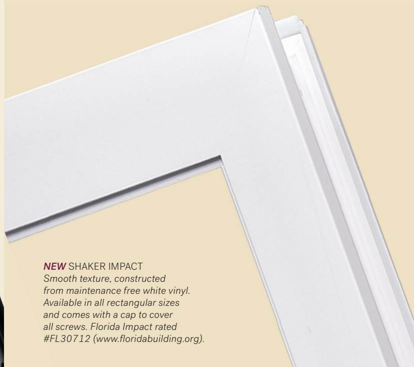
NEW SHAKER IMPACT Smooth texture, constructed from maintenance free white vinyl. Available in all rectangular sizes and comes with a cap to cover all screws. Florida Impact rated #FL30712 ( www.floridabuilding.org ).