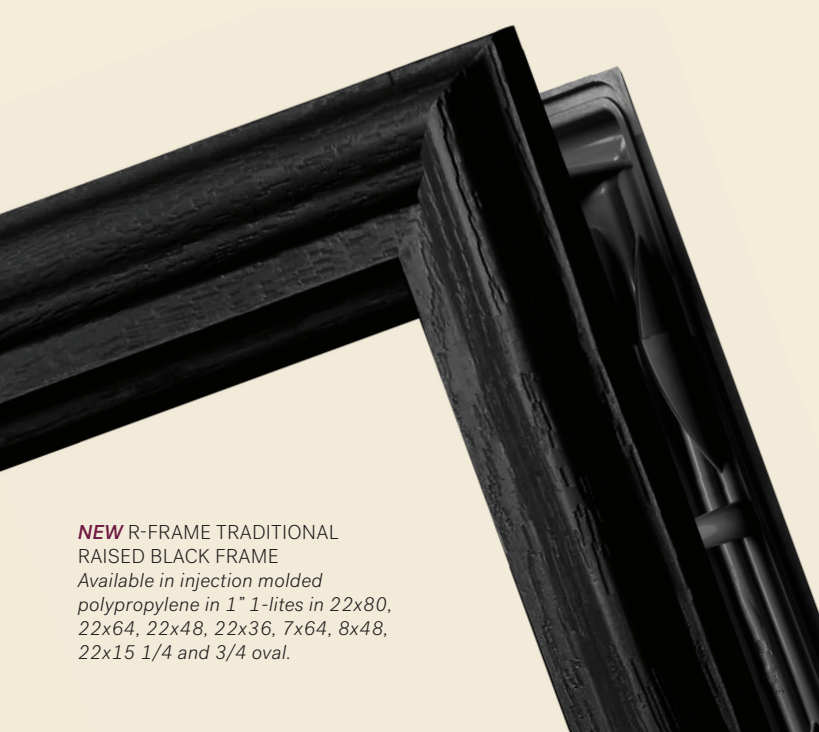
NEW R-FRAME TRADITIONAL RAISED BLACK FRAME Available in injection molded polypropylene in 1" 1-lites in 22x80, 22x64, 22x48, 22x36, 7x64, 8x48, 22x15 1/4 and 3/4 oval.