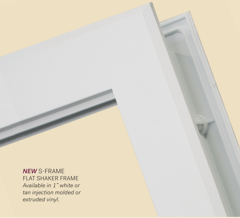
NEW S-FRAME FLAT SHAKER FRAME Available in 1" white or tan injection molded or extruded vinyl.