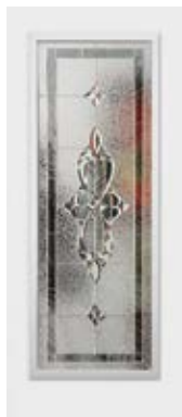
22x64 3100EM 22x80 3280EM