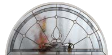
HALF ROUND TRANSOM